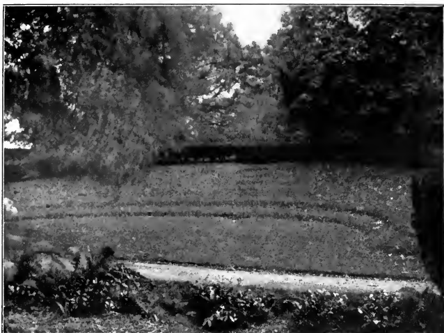
THE DEAN'S CHAIR AT GOSFORD CASTLE